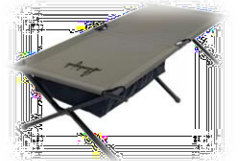
SLEEPING COTS & BEDS