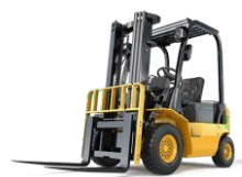
MATERIAL HANDLING EQUIPMENT