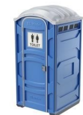
SANITARY TOILETS & SHOWERS