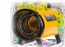
HEAT & COOLING SYSTEMS