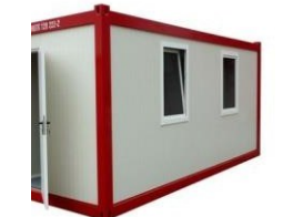
CONTAINERS (Sanitary, Shower, living, Office)